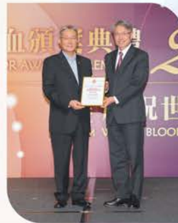
新界東醫院聯網奪得醫院管理局員工捐血大行動2015-16冠軍 The New Territories East Cluster was the winner of the Hospital Authority's Staff Blood Donation Campaign 2015-16