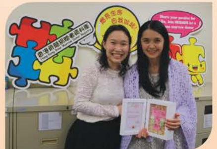
無血緣骨髓捐贈令不少病人重獲新生 Unrelated bone marrow donations have saved many patients' lives