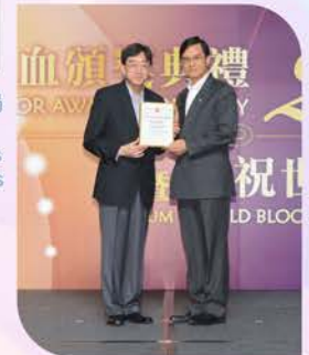
懲教署獲頒特別榮譽獎 Correctional Services Department was presented with the Special Merit Awards