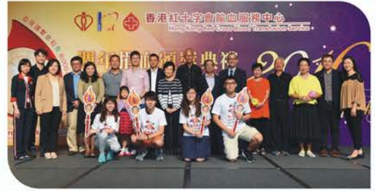
年青人接過捐血火炬，承傳捐血救人的優良傳統 The youngsters received the torch to inherit our tradition of blood donation

頒獎典禮的獲獎人數眾多，累積達25次或其倍數的捐血者總人數共3,141位。新界東醫院聯網奪得醫院管理局員工捐血大行動冠軍；神召會康樂中學榮獲賈詹士夫人盃（頒給參加捐血人數最高百分比學校）；香港專業教育學院（沙田）奪得輸血服務盃（頒給參加捐血人數最多學校）；特別榮譽獎則頒予懲教署及保誠保險有限公司以表揚他們捐血活動的支持。