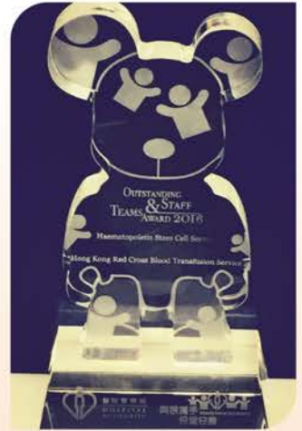
醫院管理局2016年傑出團隊獎 The Hospital Authority's Outstanding Team Award 2016

The Hong Kong Bone Marrow Donor Registry currently stores more than 107,000 registrations of potential donors. Apart from their work in Hong Kong, the Registry also works closely with bone marrow transplantation centres abroad to find matching haematopoietic stem cells for local and overseas patients.