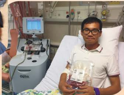
捐髓者進行周邊血造血幹細胞捐贈 Bone marrow donors on their peripheral blood stem cell donations

It is the first time for BTS to receive this Outstanding Team Award. This is a great encouragement for our team. All team members are happy to see that more awareness is raised on bone marrow donations. As more citizens register as bone marrow donors, the more likely it is to help those in need.