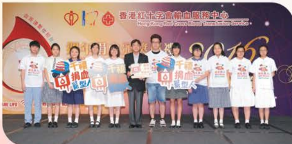
「千禧捐血新形象」- 分享生命，捐血救人 "Millennium Cool Blood Donors" - Share life, Give blood