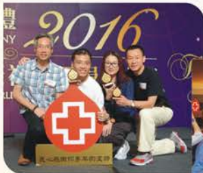
捐血者的身份令我們引以為榮! We are proud of being blood donors!