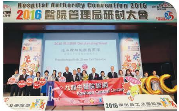
團隊全力以赴為本港及海外病人尋找合適的無血緣骨髓捐贈者 The team has been striving for their best in searching for unrelated bone marrow donors for local and overseas patients

中心首次獲醫管局頒發傑出團隊獎，團隊全體人員興奮不已，但更開心的是可喚起大家對骨髓捐贈的關注，越多市民登記捐贈骨髓，就能帶來更多重燃生命的希望。