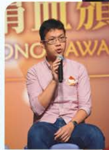
受血者由衷感謝捐血者，改寫他們的生命 Blood recipients expressed their sincere thanks to donors who saved their lives