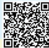
成分捐血教育短片 Apheresis Donation Educational video